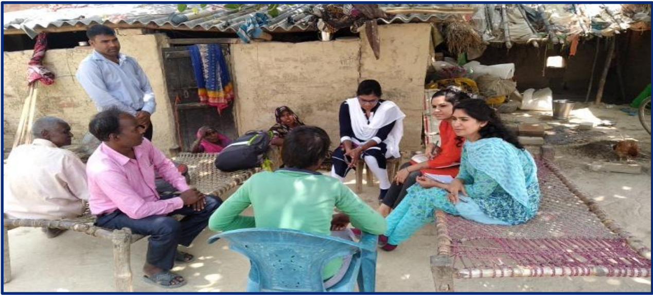
Field visit of study head for the verification and the quality inspection of the filled